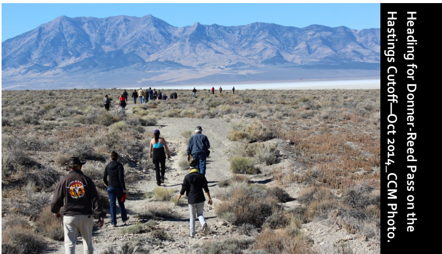
Heading for Donner-Reed Pass on the Hastings Cutoff—Oct 2014

Mark your calendars for August 2-6, 2018 as the Utah Crossroads Chapter will host the National OCTA Convention in Ogden.